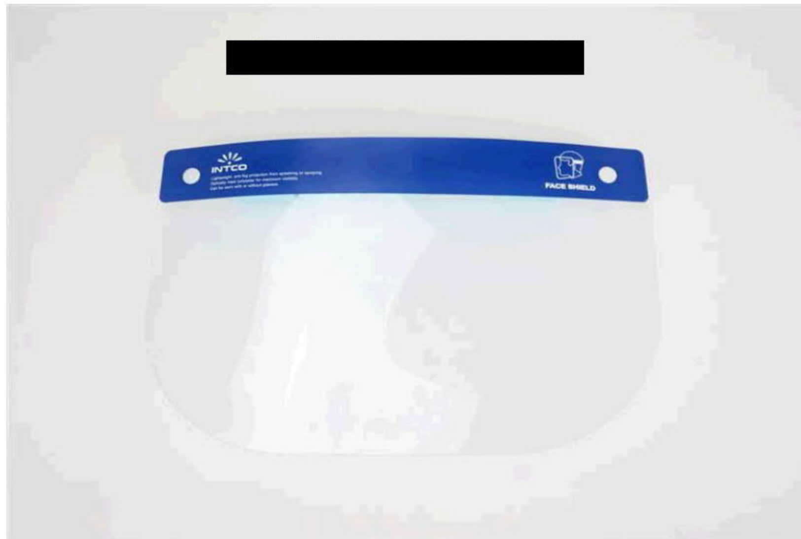
The photo is submitted by the client

SGS authenticate the photo on original report only